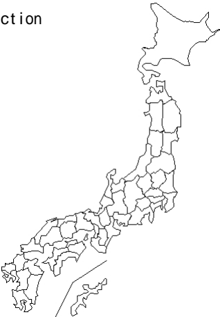
no case Enterovirus 71