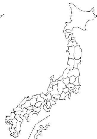
no case Aseptic meningitis