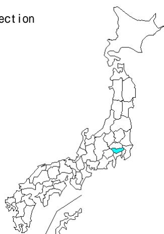
1 case Others/Unknown